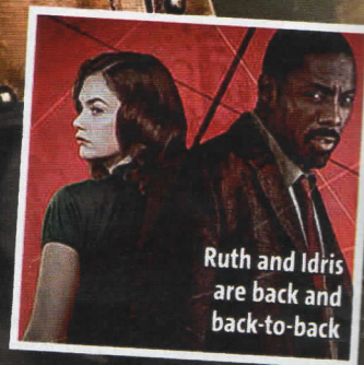
Ruth and Idris are back and back-to-back

With the excellent Ruth Wilson also starring, this is well worth your time.